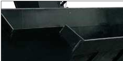
Strong & very resistant structure